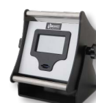
GazTrak Portable oxygen & moisture measurement