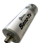
SENZTX Oxygen Transmitter