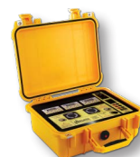
Yellow Box Portable O 2 Analyser