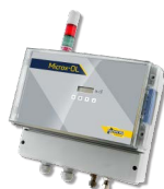
Microx-OL Online Oxygen Analyser