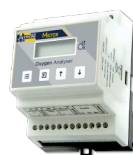
Microx Oxygen Analyser