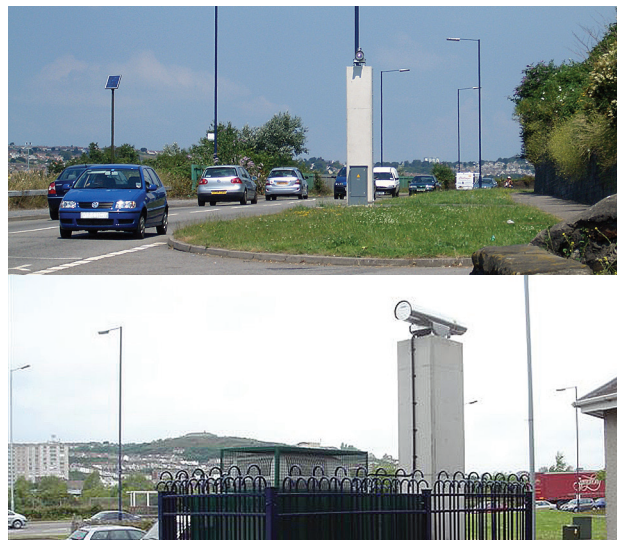
The OPSIS monitoring system is an important tool for continuous environmental control of a range of gaseous compounds at street level.