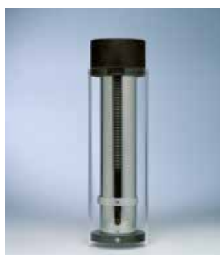
Filters and filter holder