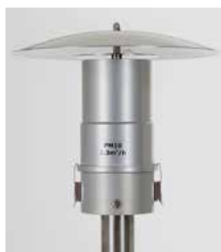
PM 10 inlet head