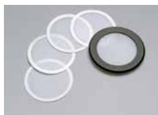
Extra filter containers minimize maintenance and make changing of filters easy