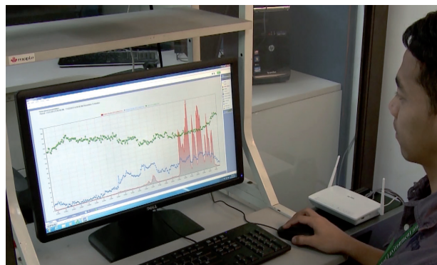
OP SIS EnviMan Cloud (OEMC) offers the user an easy way to access, protect, and store data.