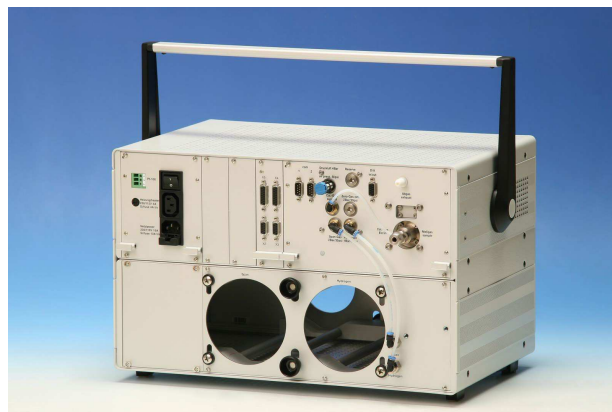
Back PT84 with bottleholder